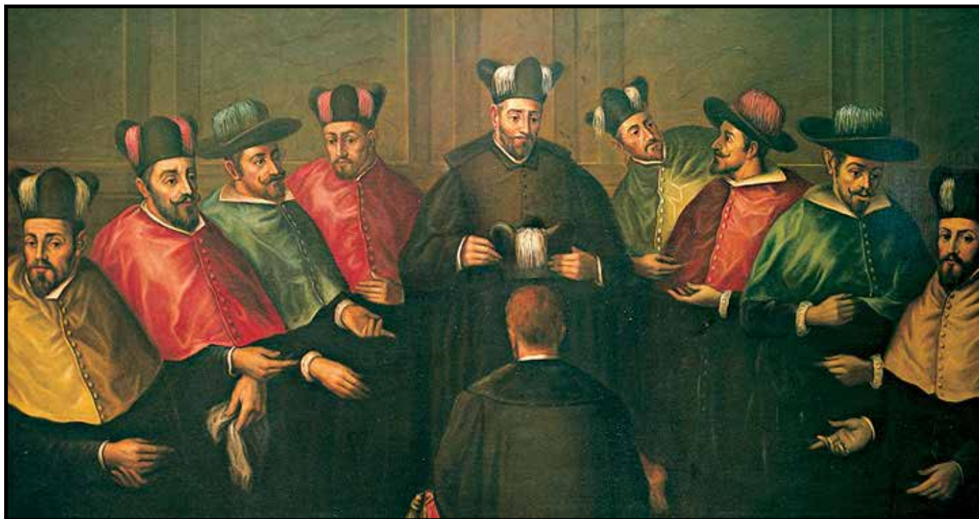
An undated painting showing the imposition of a biretta during the conferral of a doctoral degree at the Complutense University of Madrid. (The Complutense was originally founded as a Studium Generale in 1293, and was later expanded and re-named by Papal Bull in 1499.)

What must be done with higher learning ? The first thing that has to be done with higher learning is to increase it. Only in the second place must it be extended. This is where the student body enters. Inasmuch as the student body is not strictly speaking group of disciples, it is formed by future professionals who will go about their